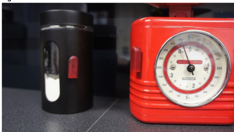
Augmenting a learning environment for language learning and cooking