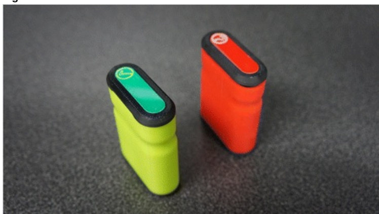
Red and green interaction tools