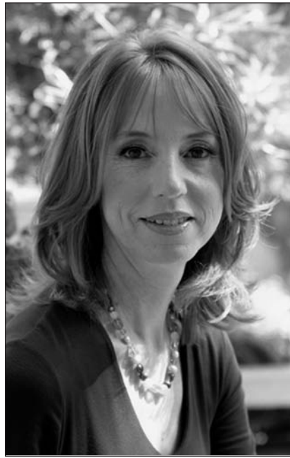
Lisa See. 2008 publicity photo.