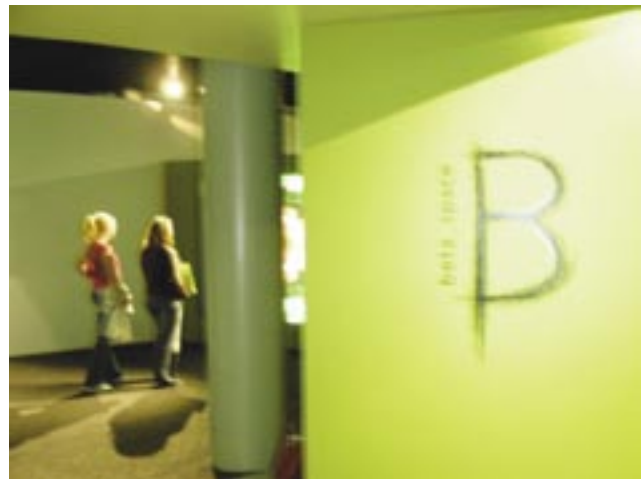
Figure 1: Beta_space in the Powerhouse Museum, Sydney

This paper explores the idea of the exhibition as a public laboratory for interactive art practice and places Beta_space within this context. The paper falls into three sections. It begins by describing the underlying rationale for why interactive art practice must engage audiences, and why this must be done in real-world settings. Section two situates the research aims of Beta_space within the landscape of enquiry into interactivity and audiences. The final section explores the concept of the art exhibition as living laboratory within the broader context of the evolution of cultural institutions and curatorial practices.