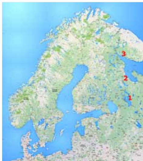
Figure 1. North West Russia has three important petroglyph areas with several depicting beluga whales. 1= Lake Kanozero, 2= Vyg River and 3= Lake Kanozero